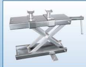
Mini jack Lifting range 3 3/4" to 15 3/4". Spin-up adapters