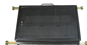
Rolling Oil Drain